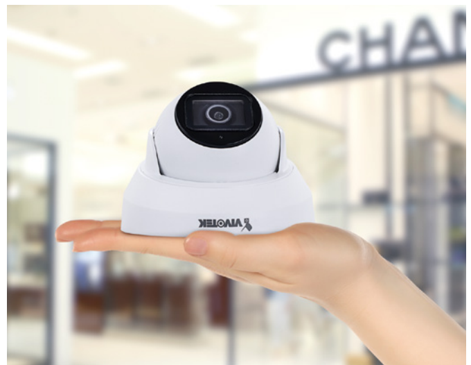
Easy Installation and Compact Size